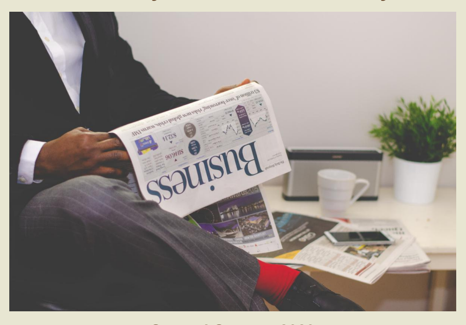
Second Quarter, 2023

The second quarter witnessed a continued upward trajectory for equity